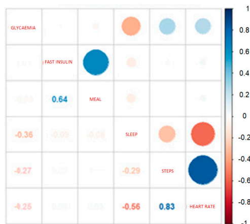
Figure 1. Correlation between features.

way, the same inverse relation can be found between exercise and sleep, for obvious reasons. So, as the inverse correlation between heart rate and sleep is stronger than the correlation between exercise and sleep, exercise could be considered as a feature reflected in heart rate values. Nonetheless, in the following study, no variable will be excluded; however, the preceding considerations could lead to the elimination of one or another feature in order to lighten the calculation tasks.