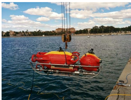
Fig. 5. Tests in Mar Menor.

To carry out an evaluation of the UUV with this control software architecture, several tests in Mar Menor coastal Lagoon were carried out (Fig.5). One set of test to evaluate the performance of SODM and other to evaluate the performance of the NNB algorithm. Conclusions of these trials are presented in next number or journal RIAI and in international conferences [9].